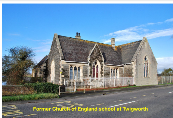
Former Church of England school at Twigworth

So the population of Twigworth has already more than doubled within 5-years and will continue to increase further over the coming years.