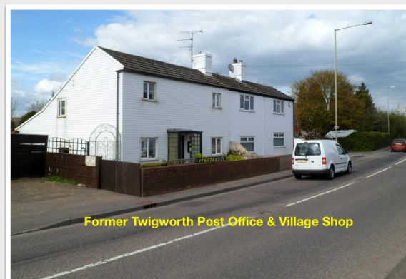
Former Twigworth Post Office & Village Shop

Twigworth once had its own Post Office and village shop, located along the Tewkesbury Road, the building is now a private residence.