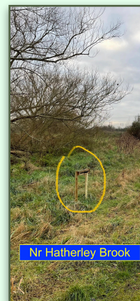
Nr Hatherley Brook