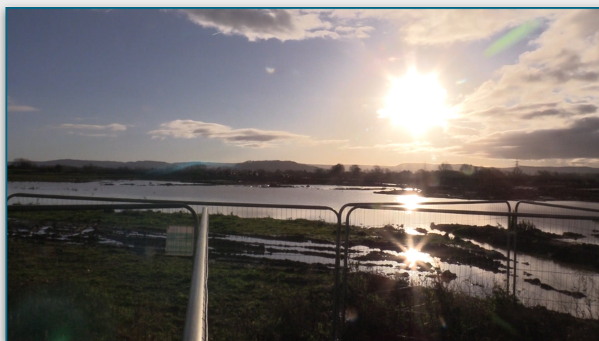
Twigworth Green on Christmas Eve 2020.