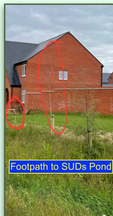
Footpath to SUDs Pond