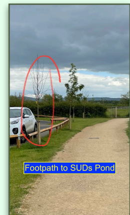
Footpath to SUDs Pond