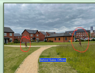
Behind Sainsbury's Office