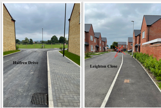
Examples of Shared Pavements

These are shared surfaces and vehicle owners are requested to park responsibly, consider your neighbours, pedestrians and children when parking... it is not acceptable to block the path families with pushchairs, disabled people and dog walkers. Cars parked half on the pavement and the road is an acceptable way of parking.